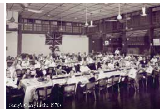
Samy's Curry in the 1970s

But, if a sweet and savoury dish is what you're looking for, pay JUMBO Seafood a visit instead to try their award-winning Chilli Crab. Have it with the traditional accompaniment of fried mantou, a Chinese bun that soaks up the delicious gravy.