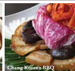
Chang Korean BBQ