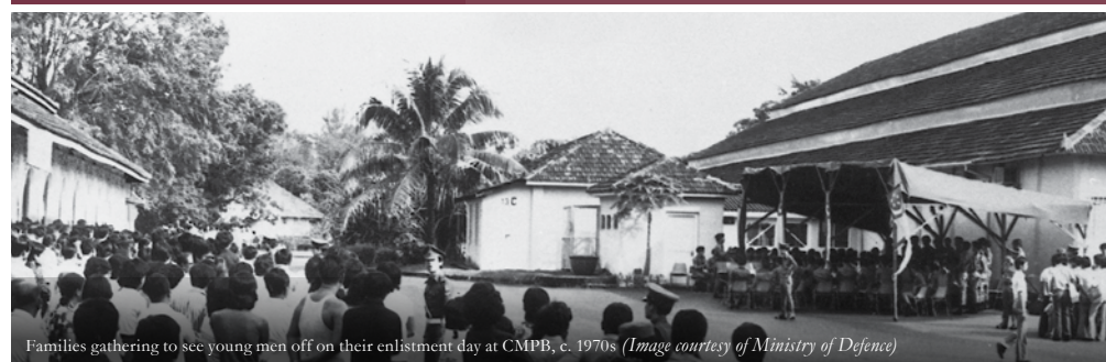
Families gathering to see young men off on their enlistment day at CMPB, c. 1970s

Originally the CMPB Registration and Recruitment Centre, Block 17 was where new recruits would first report upon enlistment. Pearl Lam Gallery at Block 15 was once the Medical Classification Centre where medical check-ups were conducted for the newly enlisted recruits. Before boarding 3-tonne trucks to be transported to their camps, these new recruits would have gathered at the Block 15, 17 and 18 Carpark , which was formerly the Parade Square.