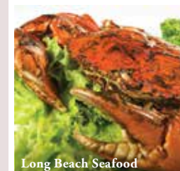
Long Beach Seafood