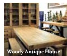
Woody Antique House