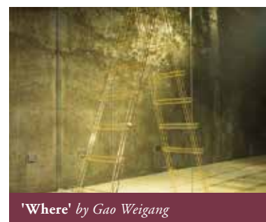
'Where' by Gao Weigang

Pearl Lam Galleries Blk 15 Dempsey Road, #01-08, S(249675) | 6570 2284