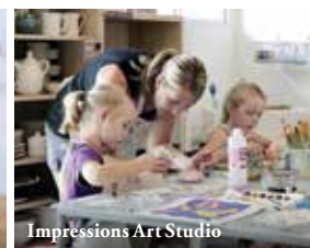
Impressions Art Studio